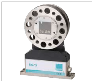
Rotor with stator