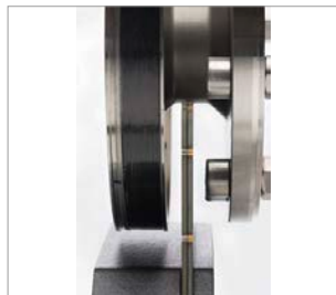
Contactless data transmission